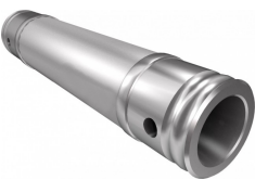
1.64 Foot - .5M F31 Single Tube Truss Segment | 2mm Wall SKU: XT-S164