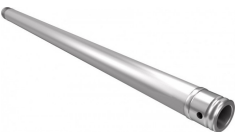
6.56 Foot - 2M F31 Single Tube Truss Segment | 2mm Wall SKU: XT-S656