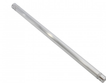
3.28 Foot - 1M F31 Single Tube Truss Segment | 2mm Wall SKU: XT-S328